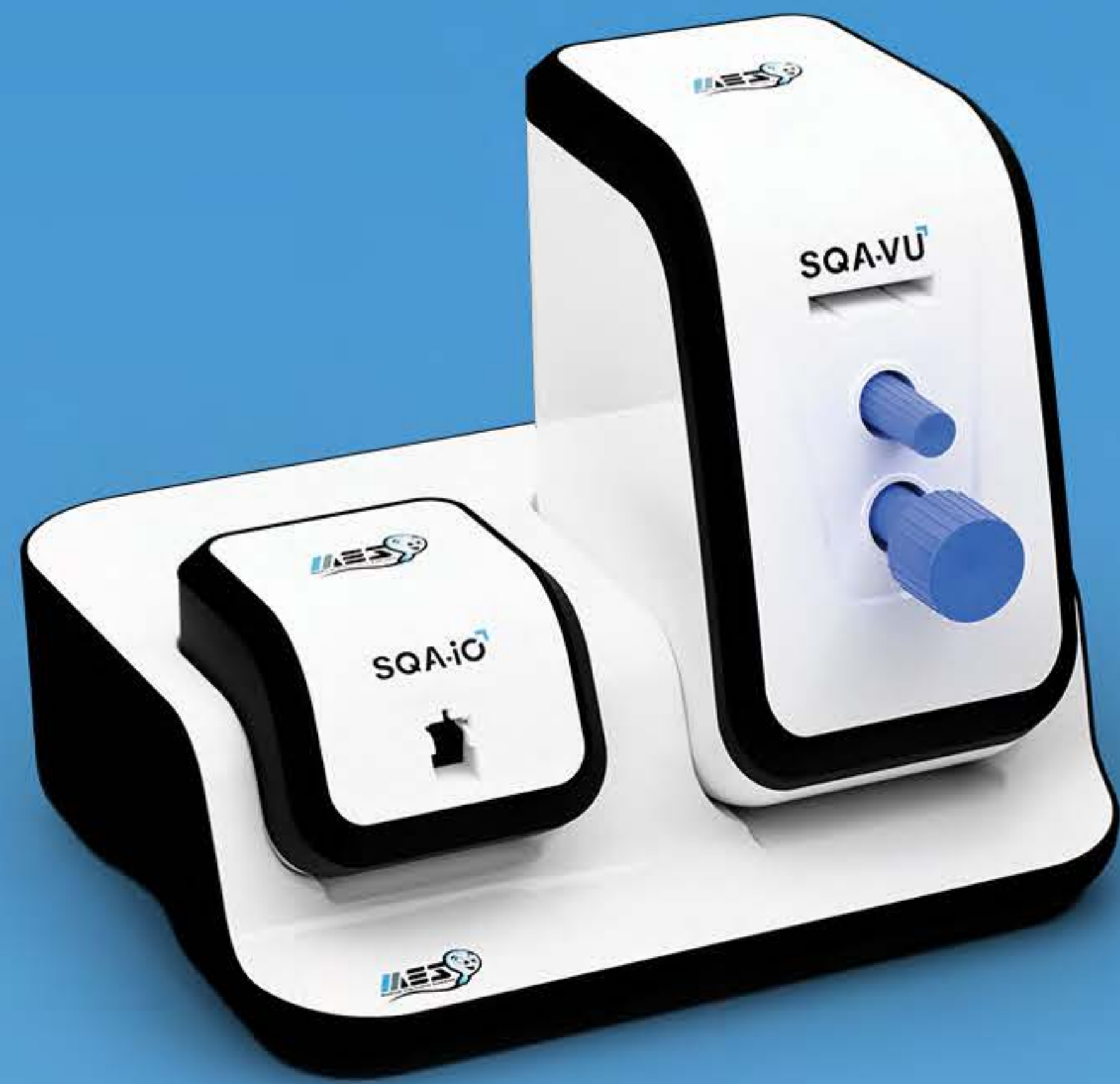
SQA-iO + Testing