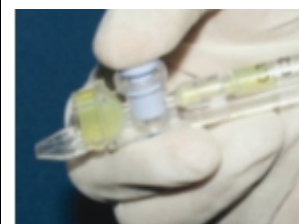
Figure 3: Press the blue valve into place.