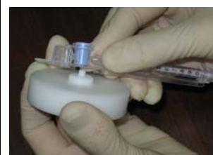
Figure 2: Reposition the blue valve