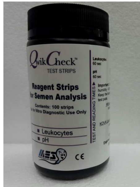
OLD Reagent Test Strips Bottle: pH/WBC