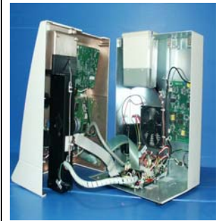
Fig. 3: Open the SQA-V