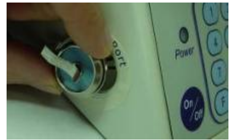
Figure 11: Insert the cable into front panel

Please note: The clip should be on the left side of the port-as shown in the figure.