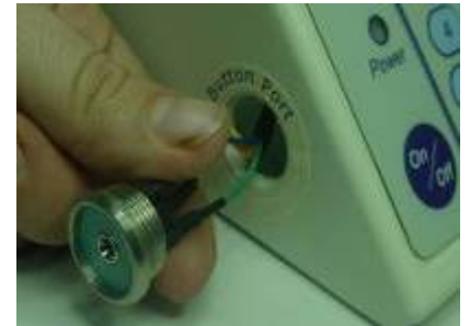
Figure 8: Pull the cable