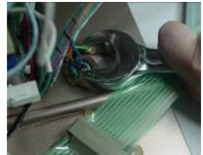
Figure 7: Release the nut