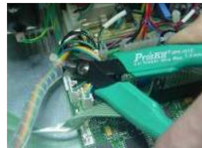
Figure 5: Remove the tie anchor mount