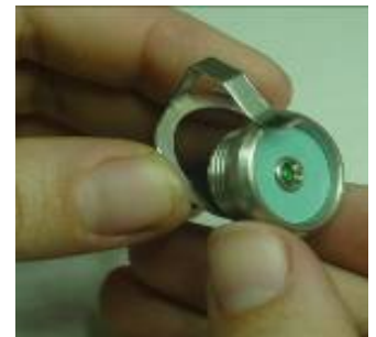
Figure 10: "bend" the rim