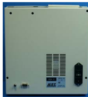
Fig. 2: Release screws