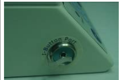
Figure 13: at the end of the process