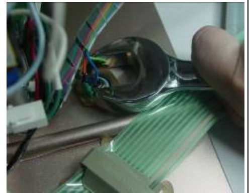
Figure 12: Fasten the I-button port

Important: Please verify that the clip remains in the same configuration shown in Fig. 11